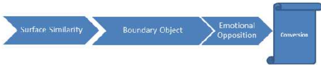
Figure 2: The Progression of “Acceptance” in the Mori Uncanny Valley

Given the existence of two labels (categories) to describe some item/event/context and the emotional attachment of the observer to the first label, as the perceived characteristics which fall into label #2 increase the observer shifts his/her perception of that label from 1) surface similarities which only highlight differences to 2) boundary objects which give rise to explorations of metaphor to 3) emotional opposition which blocks “rational discussion” to finally a begrudging acceptance that perhaps label #2 is a “better” fit.